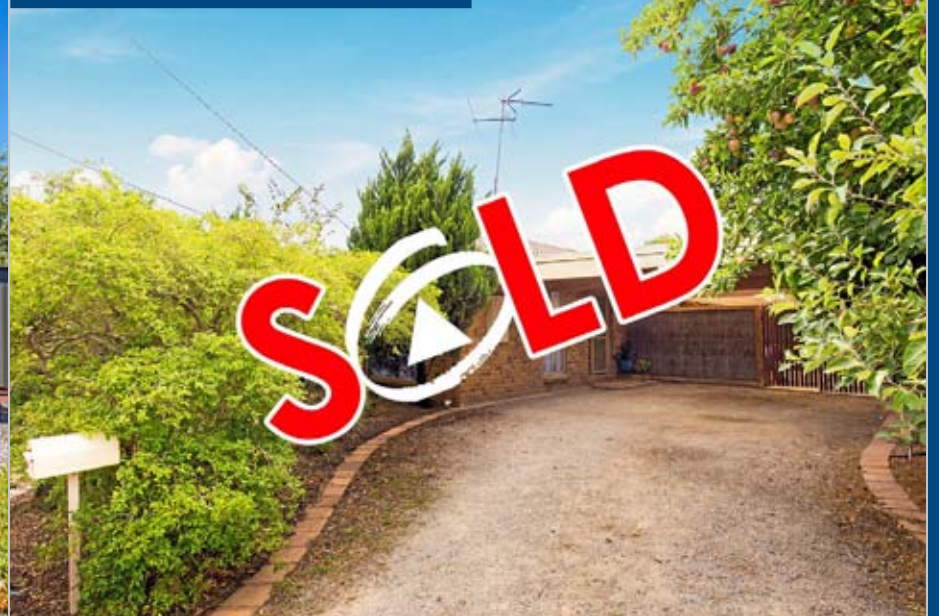
WYNDHAM VALE 21 MILLEWA WAY