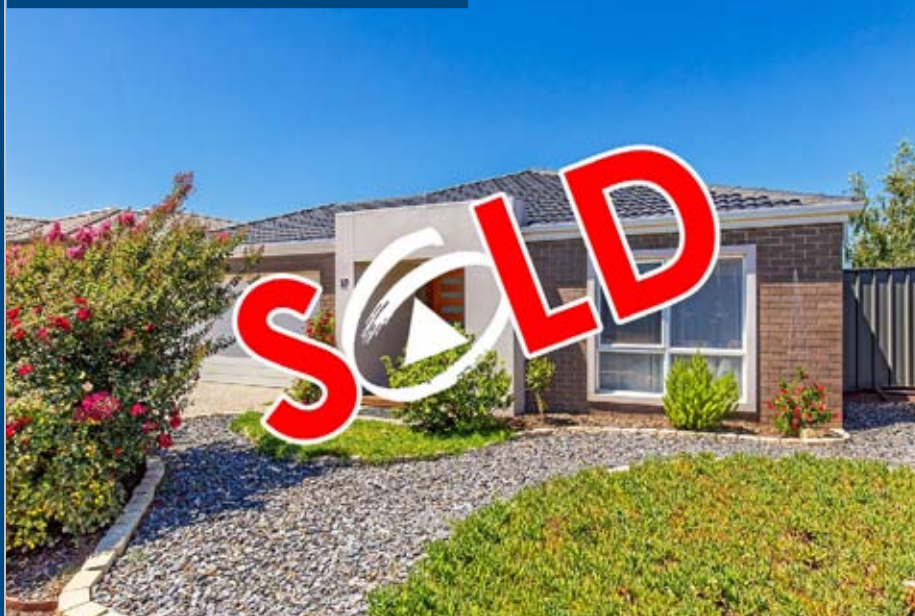
POINT COOK 37 VILLIERS DRIVE