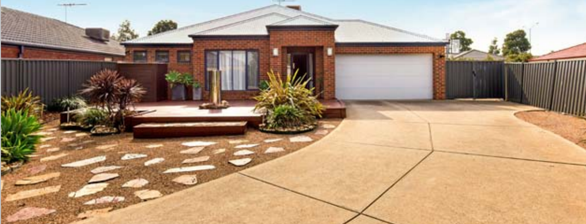
MANOR LAKES 16 BARCOO STREET