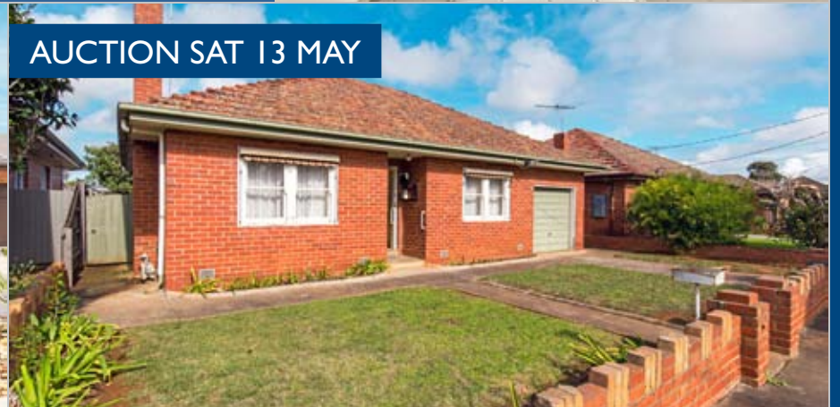
WERRIBEE 35 CARTER AVENUE