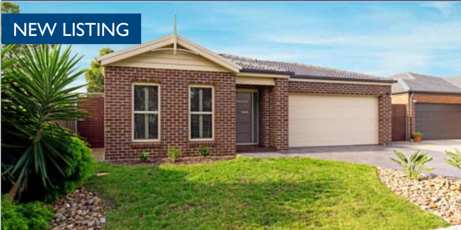
MANOR LAKES 3 MAYESBROOK ROAD